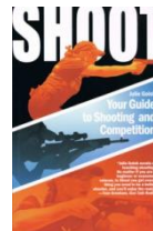
Shoot: Your Guide to Shooting and Competition Julie Golob