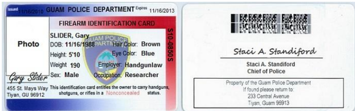
This Image has been digitally assembled from 2 or more images. It is not 100% accurate but gives a good representation of the actual Permit/License.

Guam states they will put an endorsement on the Firearms ID card as pictured below. From Handgunlaw.us understanding where it states Nonconcealed on the ID Card they will put Concealed.