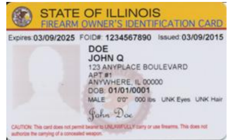
Front of New FOID Card 3/15