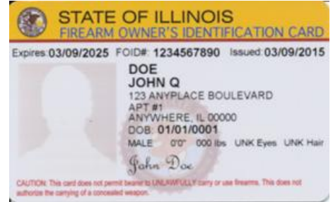
Front of New FOID Card 3/15