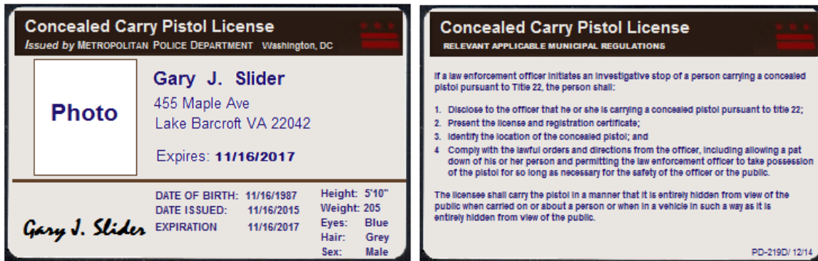
This image gives a very good representation of the District of Columbia Carry License.